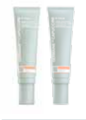
BALANCE, STRENGTHEN, HYDRATE AND SOOTHE Fundamental Moisturising Cream Textures Rich-Light