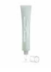
RECOVER, SOOTHE AND STRENGTHEN IN SITUATIONS OF CRISIS SOS Intensive Care Facial Balm

*HYPOALLERGENIC: Formulated to minimise risks of allergy