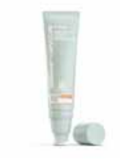
BALANCE, PROTECT, CORRECT REDNESS AND SOOTHE Correcting Moisturising Cream