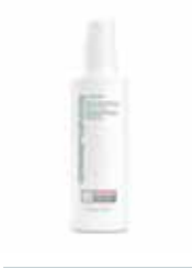
CLEANSE AND SOOTHE Micellar Water Gel